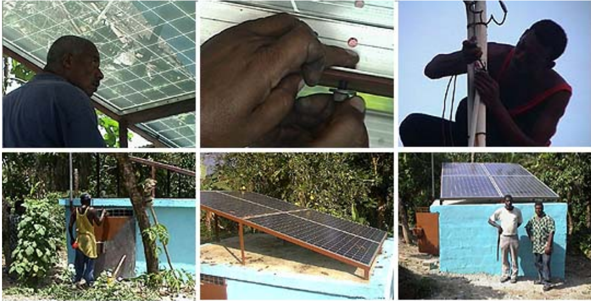
Scenes from a solar power installation designed, managed, financed and installed by Greenstar in Swift River, in the remote mountains of Jamaica.