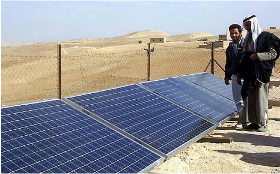
The Greenstar team was responsible for the installation of a large commercial solar array in a remote Palestinian village south of Hebron. The team worked closely with both Israeli and Palestinian specialists, to develop an array of health, education and cultural programs powered by the sun.