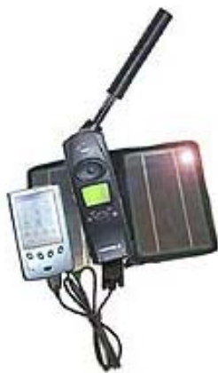
Nomad, Greenstar's new portable solar-powered satellite data system.

Most recently Greenstar has planned and deployed energy, data services and rural enterprise in the West Bank, Thailand, Ghana, Jamaica, Australia and central India, has provided advice on programs in Egypt, Vietnam, Cambodia and Papua New Guinea, and is currently engaged in projects in Brazil, Tibet, New Mexico and South Africa.