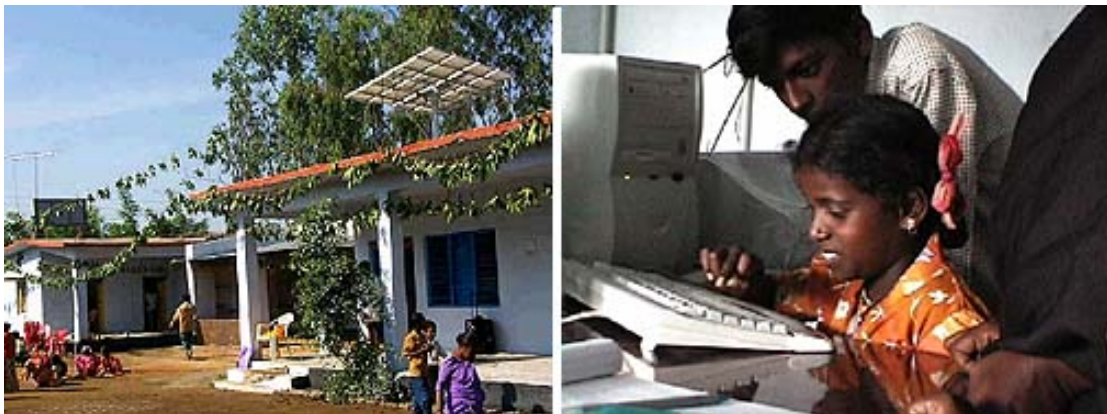
At a Greenstar installation in central India, solar power from the array on the rooftop (left) is used to power a computer learning lab in the school, which has drawn support from international businesses and regional government.